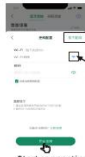
NO network, Clicking "NO yet config"