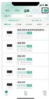
Clicking the "+" button