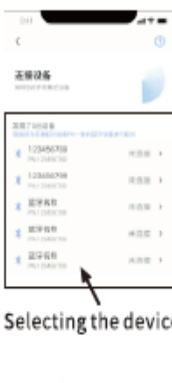
Selecting the device