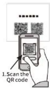
1. Scan the QR code