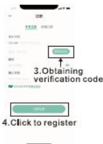
3. Obtaining verification code