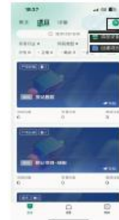
Adding devices and Creating projects

Click the create project in the upper right corner of the monitoring page, enter the create project interface to fill in the information according to the prompts, click OK to complete the create project creation