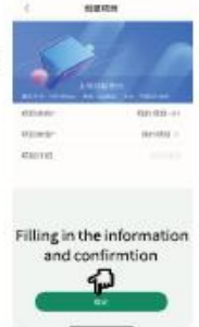
Filling in the information and confirmation