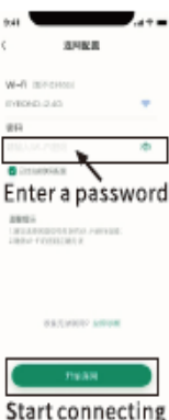
Enter a password