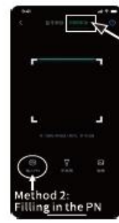
Method 1: Scanning code to add

Click "Scan code Add", scan the QR code of the data collector, or click "Enter PN" in the lower left corner to add the device