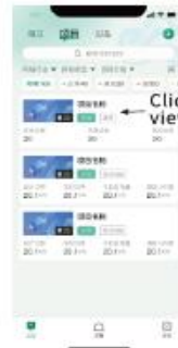
Click to view project