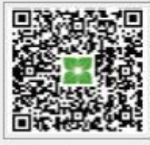
Web version manual